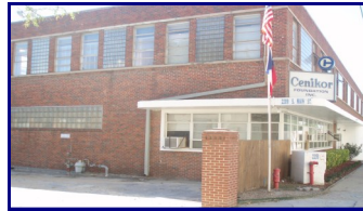
Fort Worth Facility 2209 South Main Fort Worth, Texas 76110 (817) 921-2771