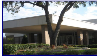
Deer Park Facility 4525 Glenwood Avenue Deer Park, Texas 77536 (281) 476-0088

1. We will save you time, energy and money. Give us a chance to show your business what Cenikor can do for you!